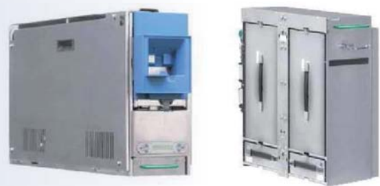
CTS CDM 10 Banknote Deposit Module

● Option Included ○ Option Against Extra Charge