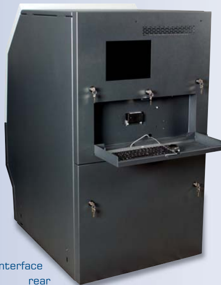
User Interface rear

The well known bulk note module from CTS Cashpro and the innovative coin module from NOVOTECH fulfill customers' requirement for maximum performance, counting accuracy and reliability. Especially in the problematic field of the coin deposit where a high reliability is indispensable a technological high-end solution is required. NOVOTECH's technology of the vertical coin conveying warrants reliability for real 24h self-service operation. In comparison to the traditional coin counting technology the vertical conveying bases on a non-chaotic vertical coin conveying against gravity, therefore, an extreme high robustness against foreign bodies can be promised. Through computer network connection the amount deposited can be transferred directly to any account. This connection may be semi-online (DTA) or full-online (WOSA/XFS).