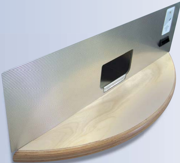
Clipboard for Bags

In comparison to the traditional coin counting technology the vertical conveying bases on a non-chaotic vertical coin conveying against gravity, therefore, an extreme high robustness against foreign bodies can be promised. Because of the optional computer network connectivity the amount deposited can be transferred directly to the customers' accounts.